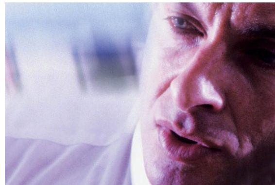
A Green Point!

Distributed By: Visual Contact Pte. Ltd Tel:+65 6846 0132 sales@visualcontact.com.sg www.visualcontact.com.sg